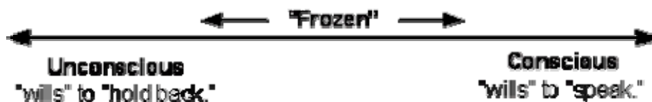
Figure 1 Frozen in the Middle

Robert is correct. It is like the proverbial mule that starved to death between the two hay stacks. He couldn't decide which one to eat from? It is like running with one foot on the gas pedal and the other one on the brake? In the process you get nowhere but you burn out. Just think how much energy you expend trying not to block/stutter.